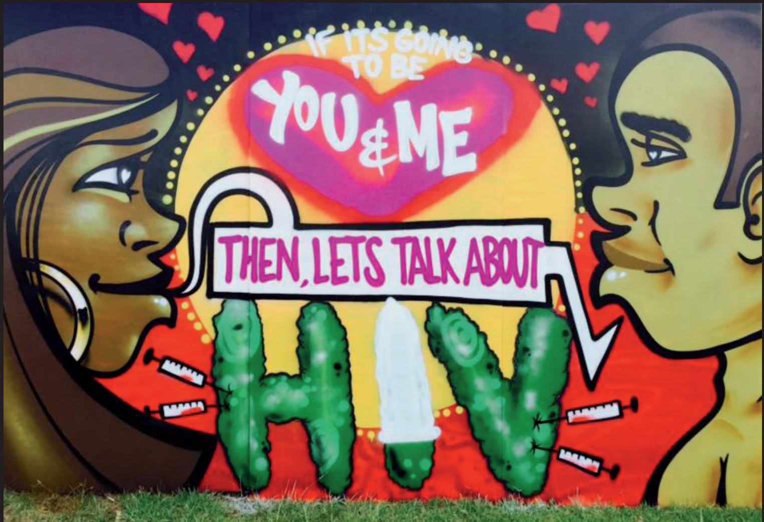
Mural from Tharawal Aboriginal Corporation