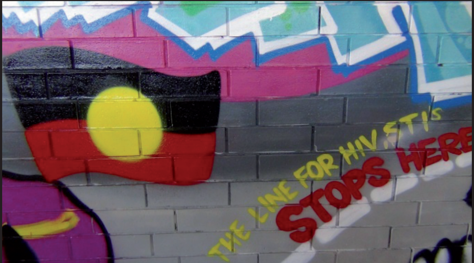
Mural from Aboriginal Medical Service Western Sydney – Blacktown Youth College.