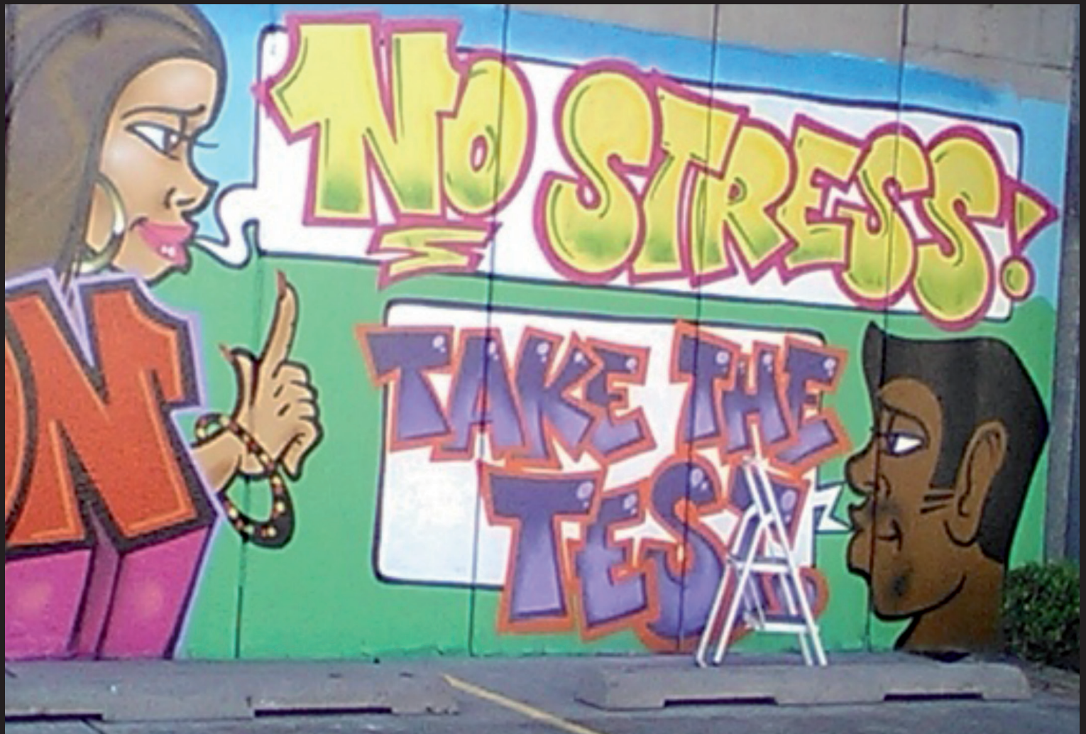
Mural from Kempsey