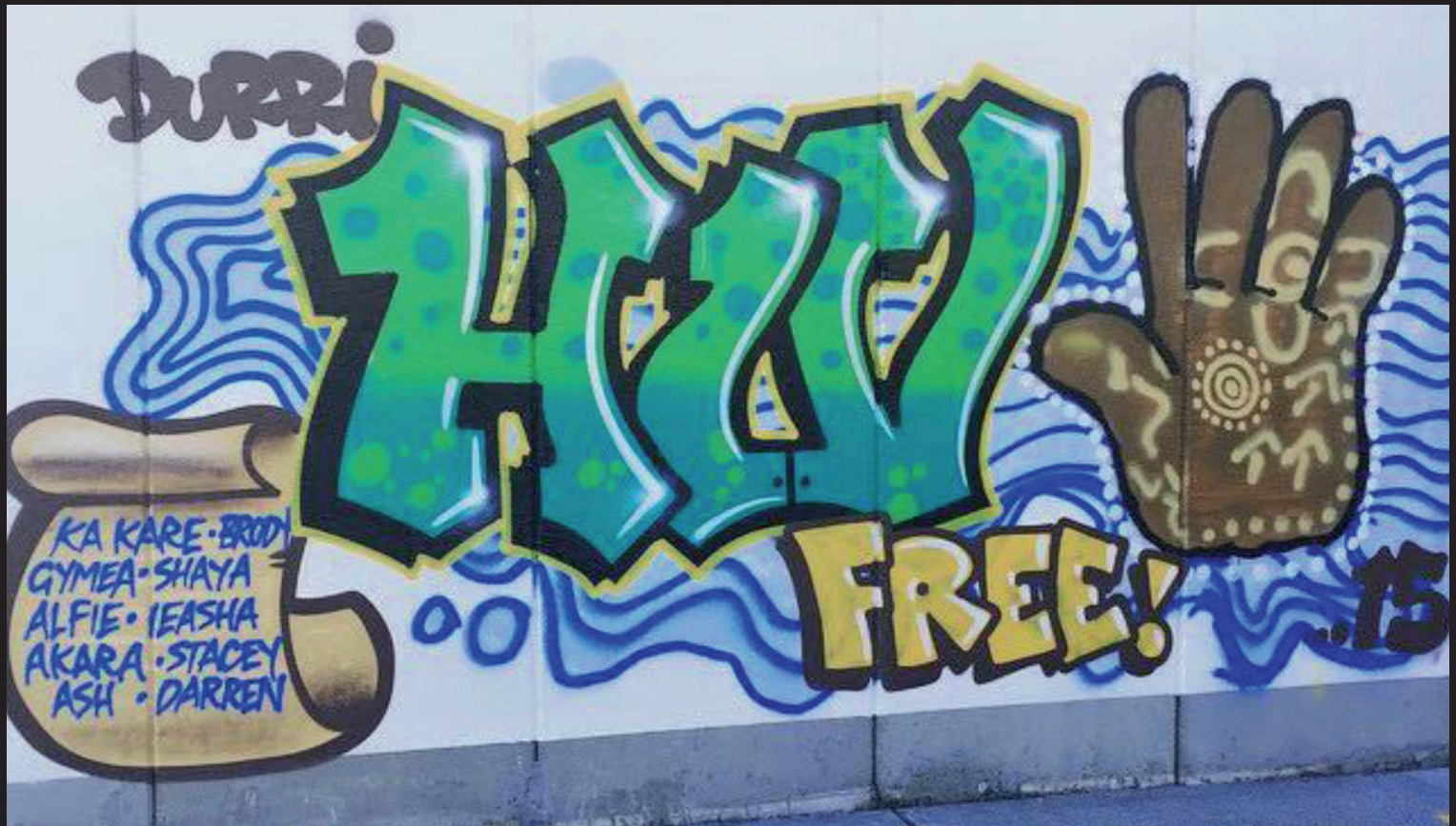
Mural from Kempsey