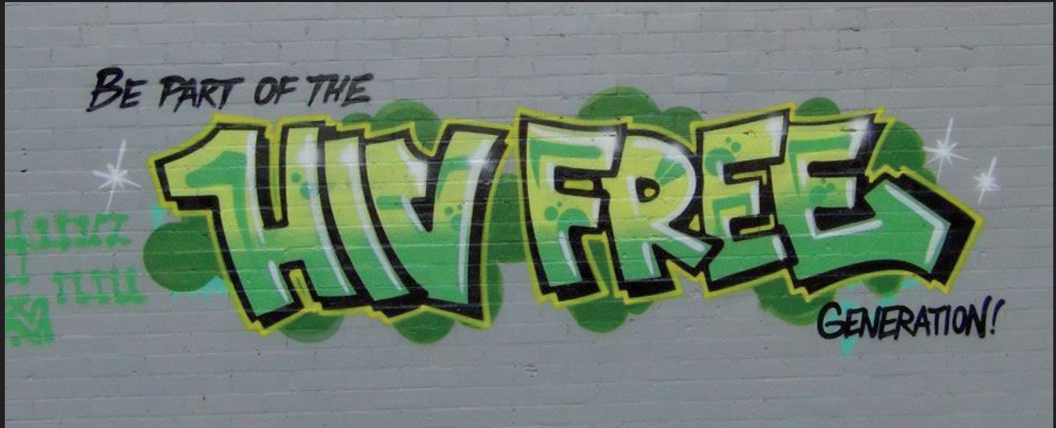
Mural from Narooma High School

The project was delivered in four locations from December 2014–June 2015, involving schools, youth services and other local services.