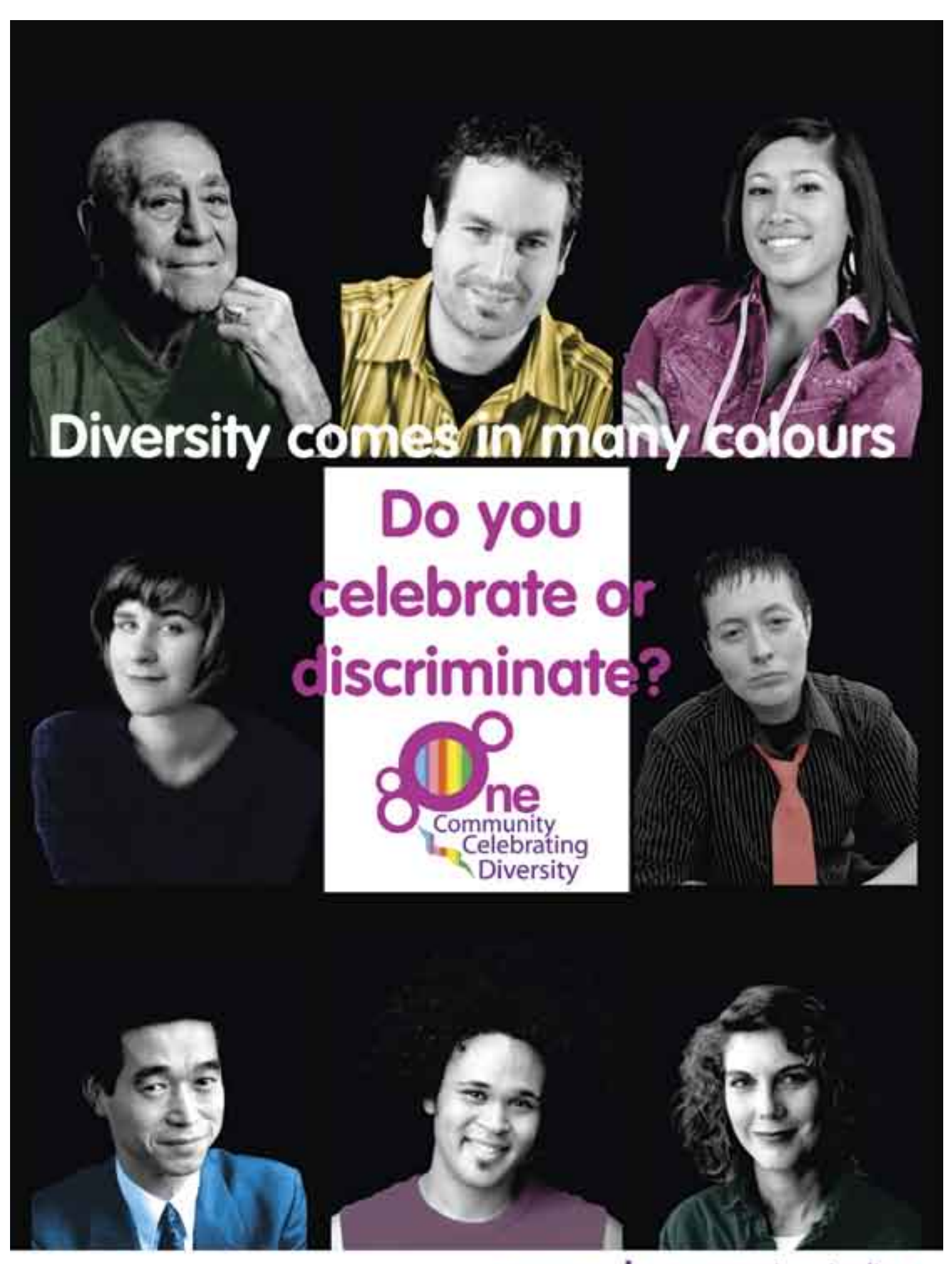
To learn more about prejudice go to: www.qahc.org.au/prejudice