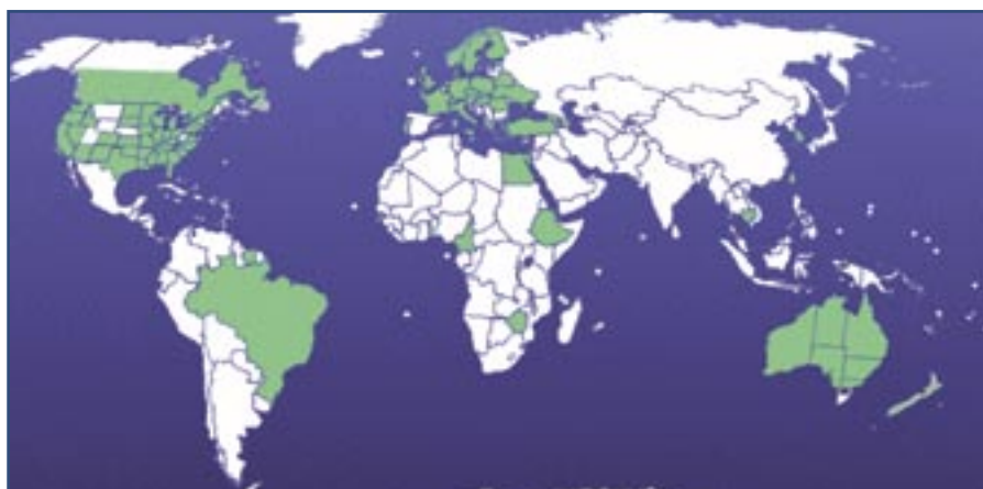
Figure 2: Countries where prosecutions for non-disclosure, alleged exposure and transmission have taken place

weapon, and it is not uncommon for such individuals – often homeless or poor with no good defence lawyer – to be sent to prison for decades, and sometimes for life. 10