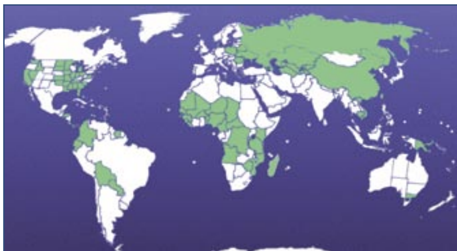
Figure 1: Countries with HIV-specific criminal laws

Europe is followed by Asia (9), Africa (4), Latin America (3), North America (2) and Oceania (2). However, the two countries of North America account for the vast majority of global prosecutions. In Canada, where the law characterises non-disclosure of known HIV-positive status prior to sex that carries a ‘significant risk’ of harm as rape, there are, on average, ten prosecutions a year. 8 In the United States a new case is reported almost every week. About a quarter of all US HIV-related prosecutions between 2007 and 2009 were for spitting or biting. 9 Despite it being impossible for spitting (and virtually impossible for biting) to transmit HIV, the police and courts take these threats as seriously as if the person with HIV had a loaded